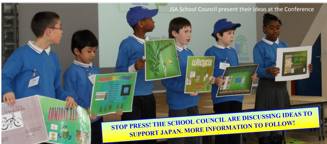
JSA School Council present their ideas at the Conference

The Y4/5/6 children are now preparing reports on their experiences, including an unexpected treat which the taxi driver organised for the children on the way back to the train station on Friday. To read about this and much more....watch out for the report in the next newsletter!