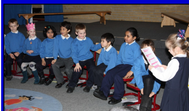
Year 1/2 Assembly